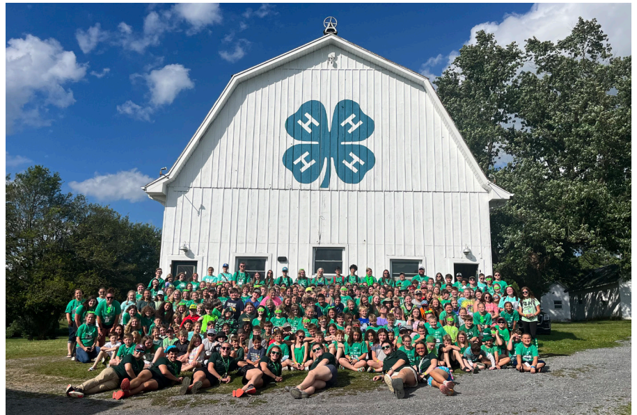
Russell County youth pose for a photo during a week at 4-H Camp.